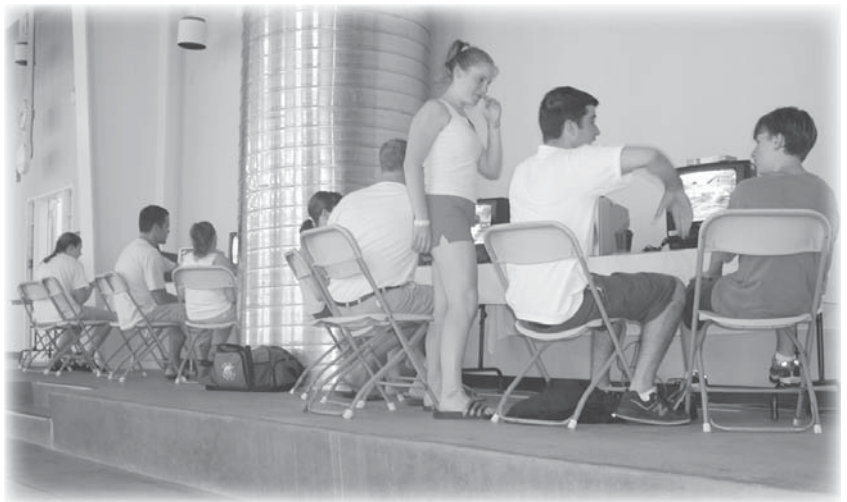
Every camper has the opportunity to go over video footage with one of our coaches.