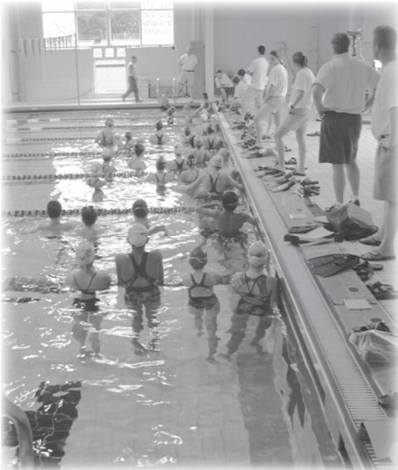
Hamilton Swim Camp - A coach in every lane.