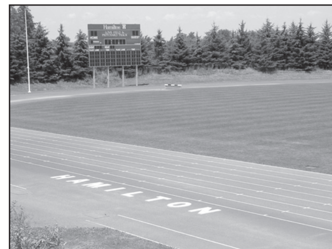
The Walter H. Pritchard Track is the home of Hamilton College Outdoor Track and Field

2009 T&F: Made the all-state team for finishing second in the 3000m steeplechase at the NYSCTC Championships. 2008 XC: Top five runner on team as a first year. ... Named NESCAC Women's Performer of the Week on Sept. 15... Made the second team all-state at the NYSCTC Championships... Earned USTFCCCA all-academic honors.