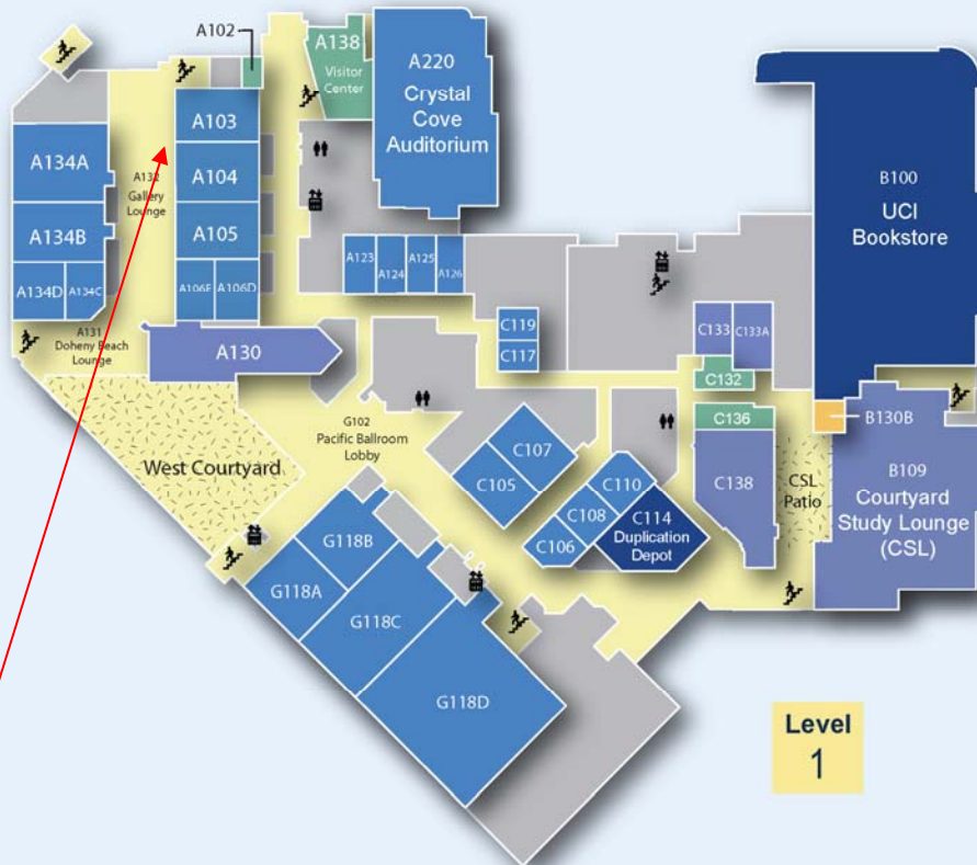
Crescent Bay Room (A103 & A104)