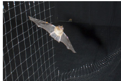
Big brown bat negotiating net obstacle.

Bats are the ultimate evolutionary opportunists. To cash in on the bonanza of insects that take to the air after dark, the mammals have developed agile flight and a unique echolocation system to locate fast-moving bugs in the dark. However, Benjamin Falk from Johns Hopkins University, USA, explains that although bat flight and echolocation had been studied extensively, they had never been investigated simultaneously: wind tunnels are too noisy to record echolocation calls and the animals' natural movements were too complex to analyse as they flew freely. That was until 3D motion capture technology became available. The sophisticated system allows scientists and Hollywood directors to reproduce complex natural movements for research and the movies. So, when Cynthia Moss acquired 10 motion-tracking cameras while Falk was in her lab at the University of Maryland, USA, the scene was set for him to find out more about how nimble bats coordinate their echolocation calls with flight.