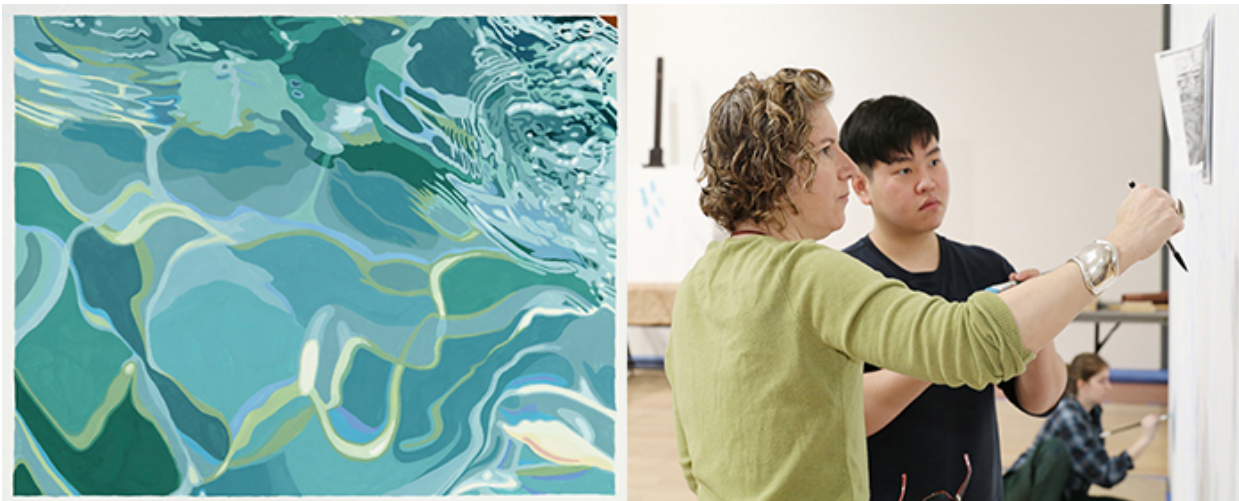
Left image: Julia Jacquette, Swimming Pool Water (Hand) , 2015, Gouache on paper, 9 ½ x 12 ½ inches