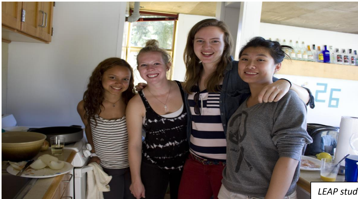
LEAP students cook with their mentor

LEAP strives to develop six key skills in all of its participants: self-awareness, organization, negotiation, active listening, public speaking, and networking. To foster these skills in first-year students, LEAP participants engaged in team-building activities such as Scavenger Hunts and Iron Chef competitions, participated in public speaking workshops, and were invited to special lectures given by Hamilton professors on topics such as moral courage, decision-making, elevator pitches, and more.