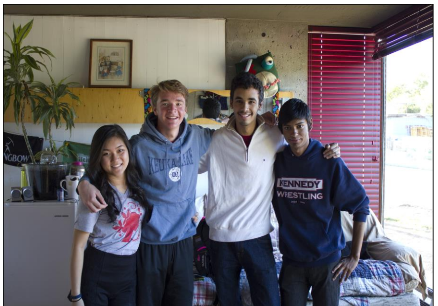
LEAP students with their mentor

This coming fall, LEAP is experiencing another exciting change. Starting with the Class of 2018, LEAP students will now take a philosophy course for academic credit focused on the role that transformational leadership plays in the pursuit of happiness. Material learned in the classroom throughout the week will be reinforced on the weekend with leadership exercises and group activities. LEAP students will not only learn about leadership in theory, but will also have an opportunity to practice it.