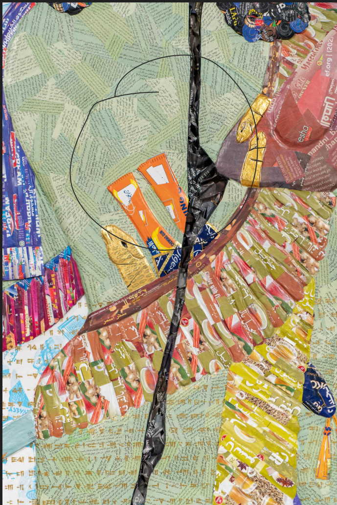
Michael Rakowitz (Installation view of new sculpture on view for the first time, commissioned by the Ruth and Elmer Wellin Museum of Art at Hamilton College.) Panel H-16, Room H, Northwest Palace of Nimrud, from the series The Invisible Enemy Should Not Exist , 2020.