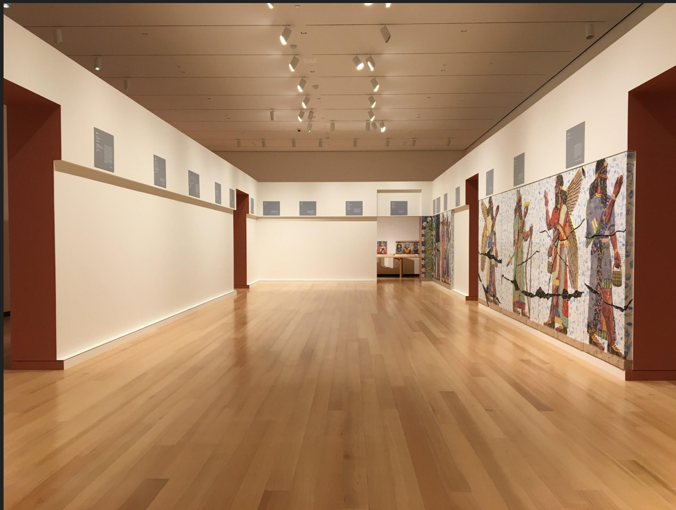
Michael Rakowitz (Installation view of new sculpture on view for the first time, commissioned by the Ruth and Elmer Wellin Museum of Art at Hamilton College.) Room H, Northwest Palace of Nimrud, from the series The Invisible Enemy Should Not Exist , 2020.