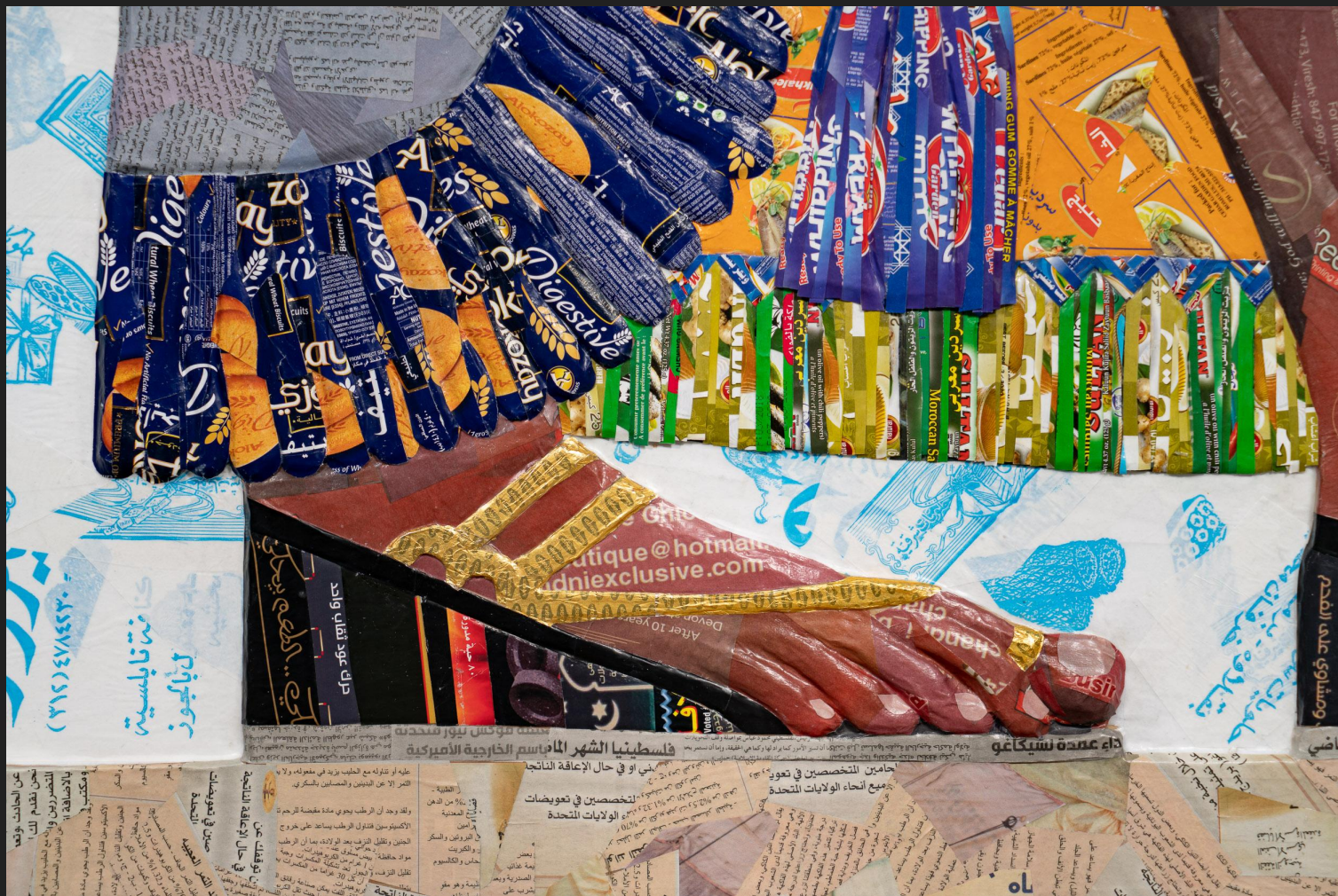
Michael Rakowitz (Installation view of new sculpture on view for the first time, commissioned by the Ruth and Elmer Wellin Museum of Art at Hamilton College.) Panel H-17, Room H, Northwest Palace of Nimrud, from the series The Invisible Enemy Should Not Exist , 2020.