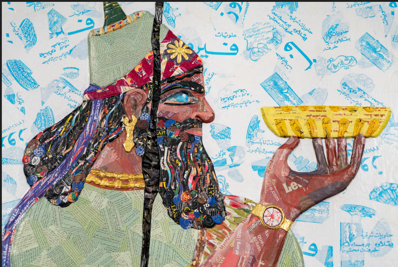
Michael Rakowitz (Installation view of new sculpture on view for the first time, commissioned by the Ruth and Elmer Wellin Museum of Art at Hamilton College.) Panel H-16, Room H, Northwest Palace of Nimrud, from the series The Invisible Enemy Should Not Exist, 2020.