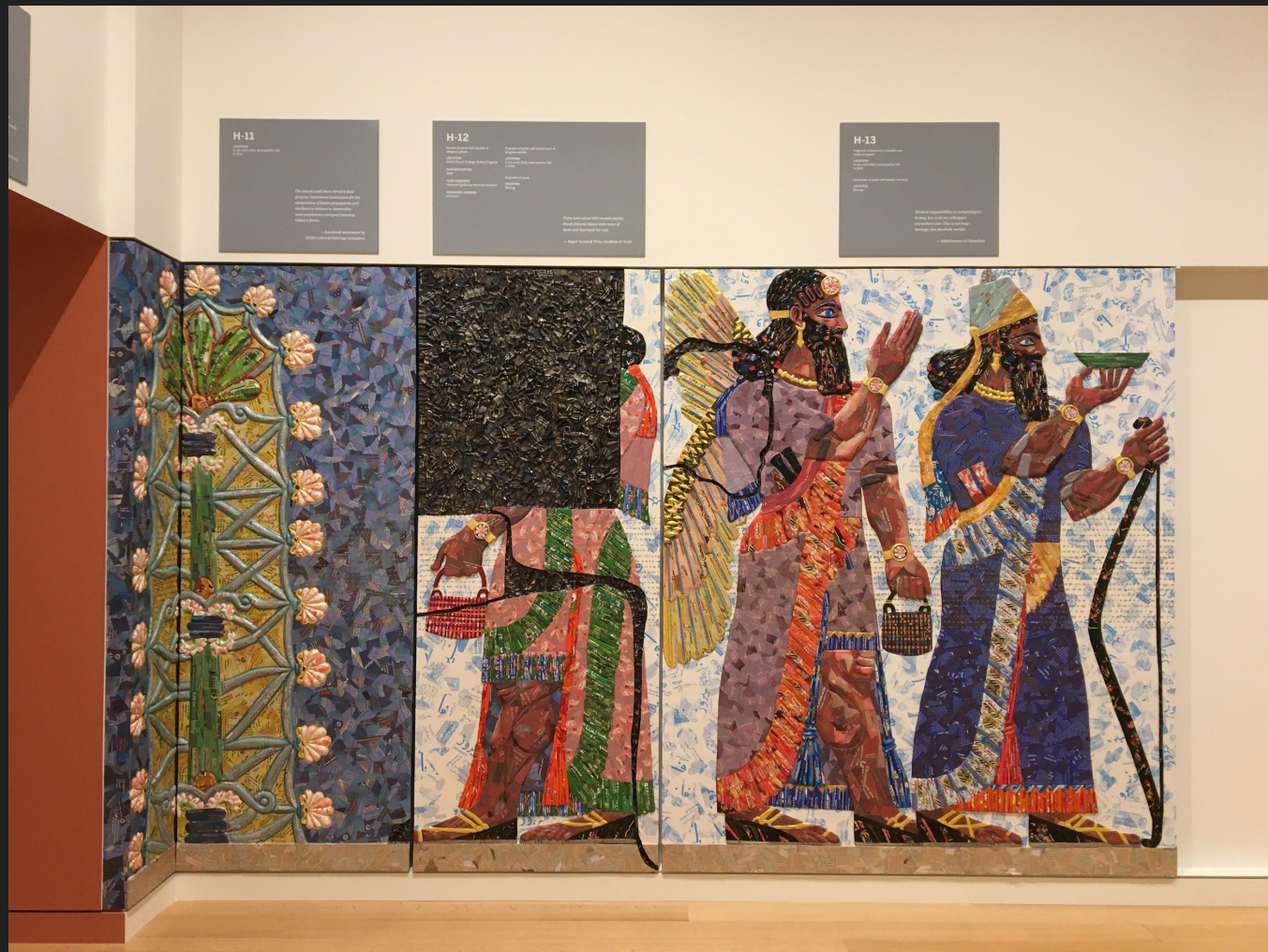
Michael Rakowitz (Installation view of new sculpture on view for the first time, commissioned by the Ruth and Elmer Wellin Museum of Art at Hamilton College.) Room H, Northwest Palace of Nimrud, from the series The Invisible Enemy Should Not Exist , 2020.