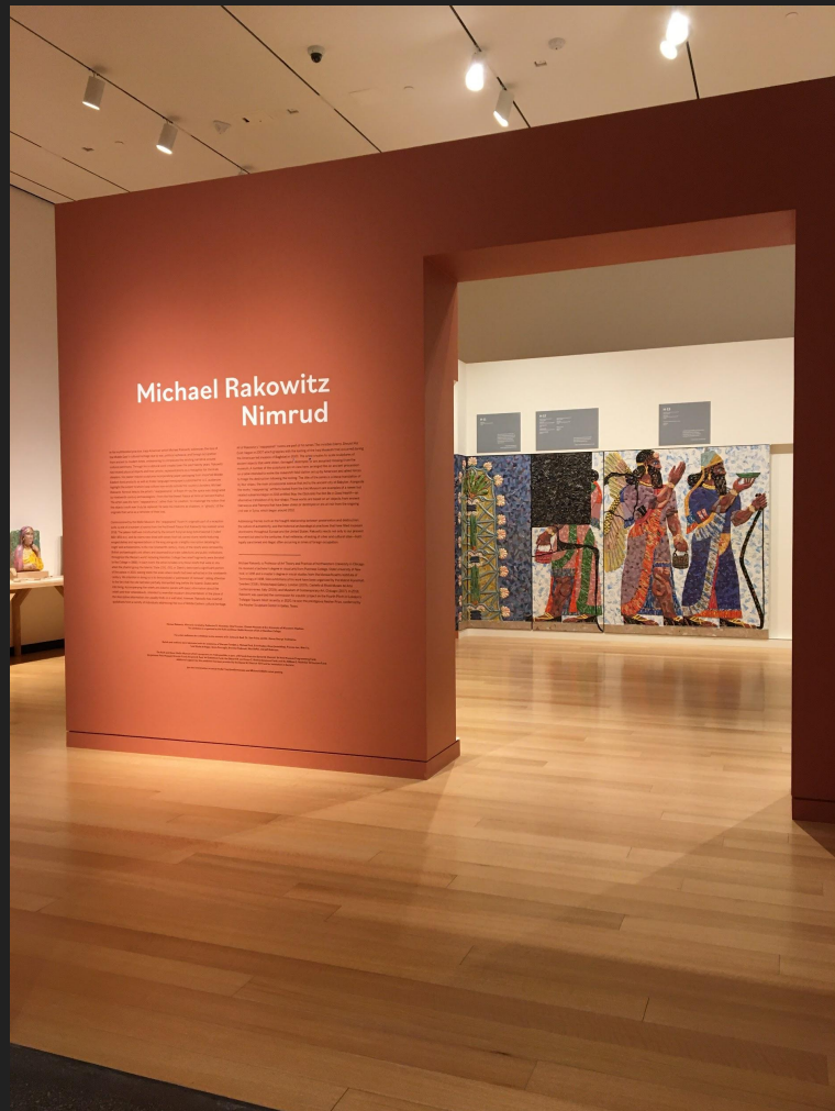
Michael Rakowitz (Installation view of new sculpture on view for the first time, commissioned by the Ruth and Elmer Wellin Museum of Art at Hamilton College.) Room H, Northwest Palace of Nimrud, from the series The Invisible Enemy Should Not Exist , 2020.