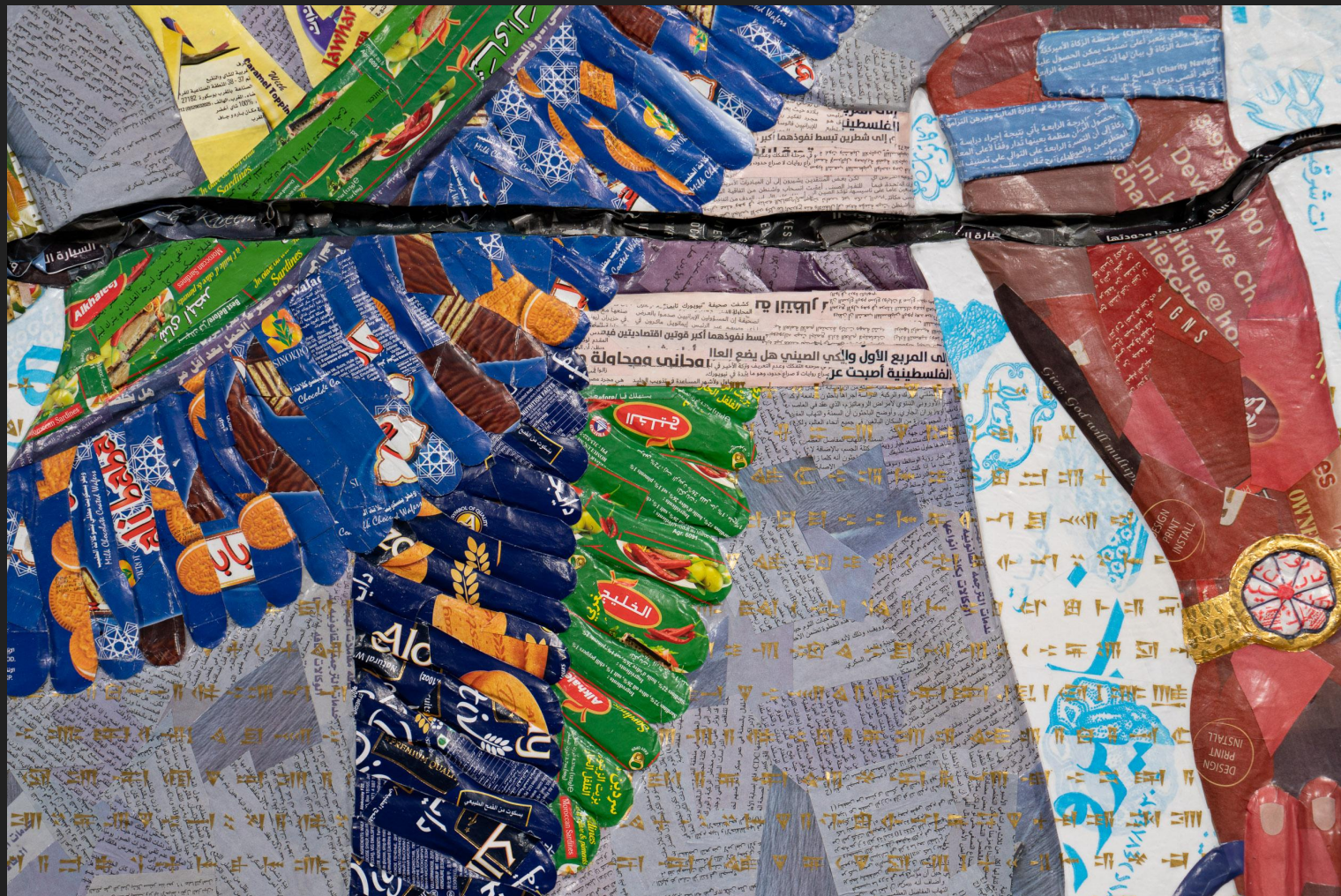
Michael Rakowitz (Installation view of new sculpture on view for the first time, commissioned by the Ruth and Elmer Welin Museum of Art at Hamilton College.) Panel H-17, Room H, Northwest Palace of Nimrud, from the series The Invisible Enemy Should Not Exist , 2020.