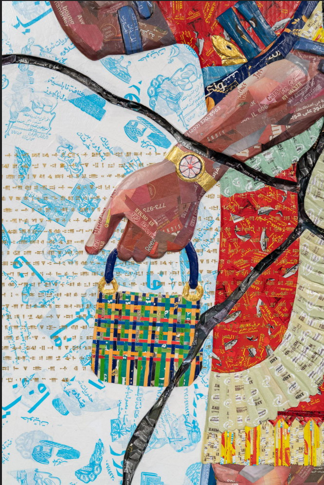
Michael Rakowitz (Installation view of new sculpture on view for the first time, commissioned by the Ruth and Elmer Wellin Museum of Art at Hamilton College.) Panel H-17, Room H, Northwest Palace of Nimrud, from the series The Invisible Enemy Should Not Exist , 2020.