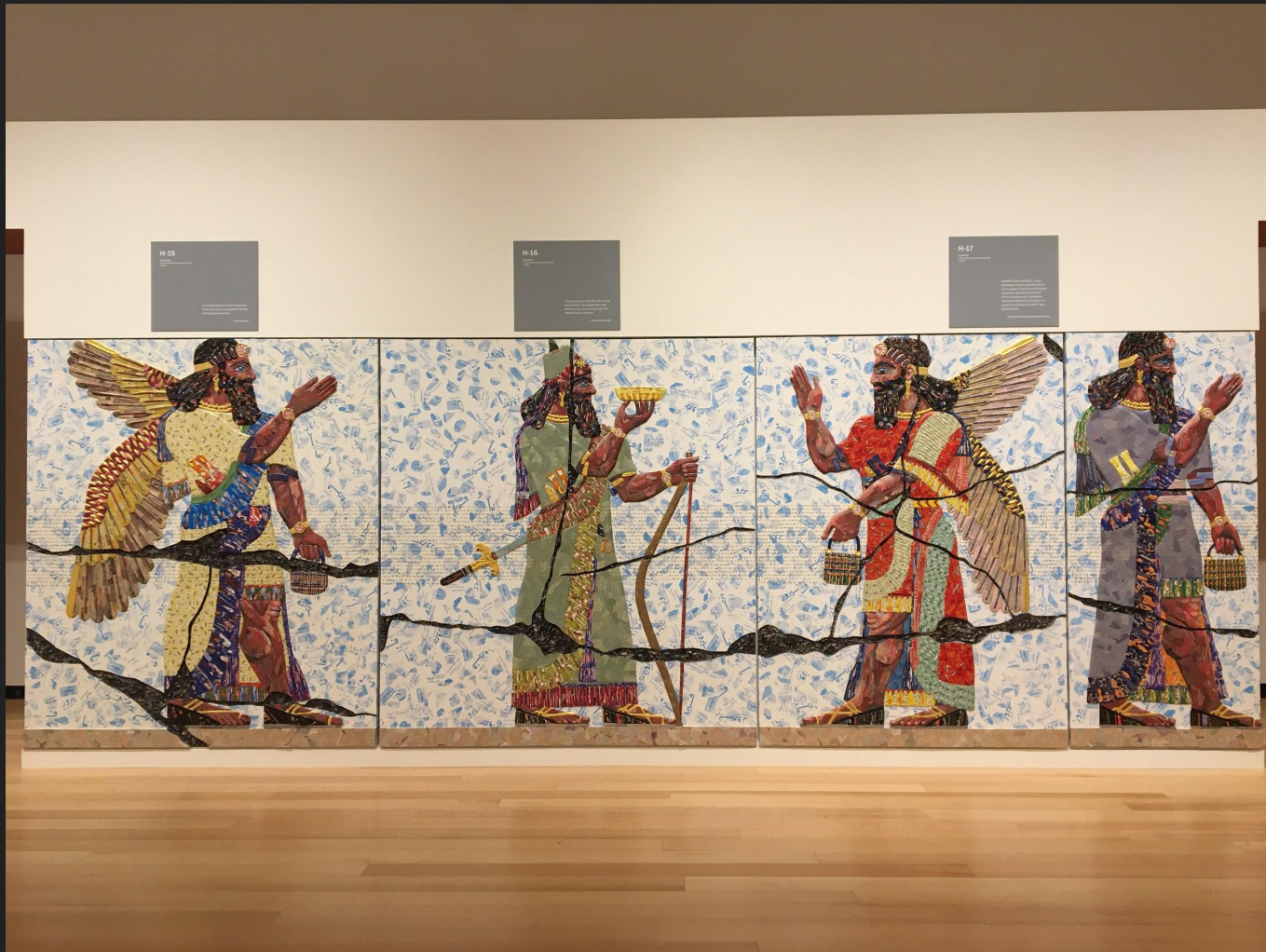
Michael Rakowitz (Installation view of new sculpture on view for the first time, commissioned by the Ruth and Elmer Wellin Museum of Art at Hamilton College.) Room H, Northwest Palace of Nimrud, from the series The Invisible Enemy Should Not Exist , 2020.