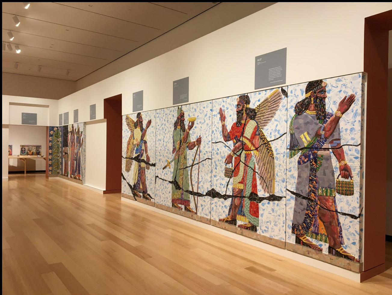
Michael Rakowitz (Installation view of new sculpture on view for the first time, commissioned by the Ruth and Elmer Wellin Museum of Art at Hamilton College.) Room H, Northwest Palace of Nimrud, from the series The Invisible Enemy Should Not Exist , 2020.