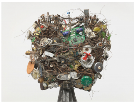
Jack Whitten, "Lucy" (2011), black mulberry, mixed media, Phaistos stone, mahogany, metal I-beam