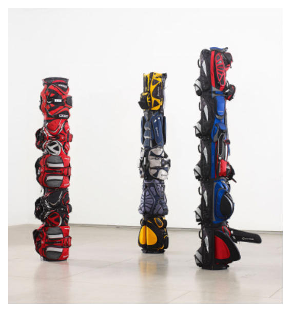
Brian Jungen, polyester, metal, painted wood on paper sonotube, 2007 (image courtesy Art Gallery of Ontario, © Brian Jungen 2017)