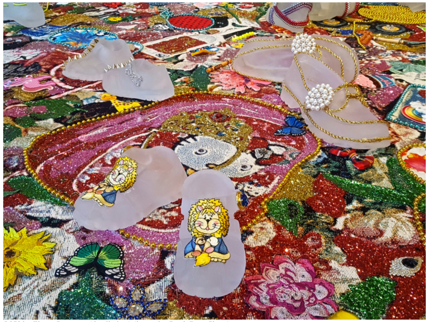
Of 72 by Ebony Patterson (detail view)

Art visualizing identity and community took center stage in our top 20 exhibitions across the United States for 2018.