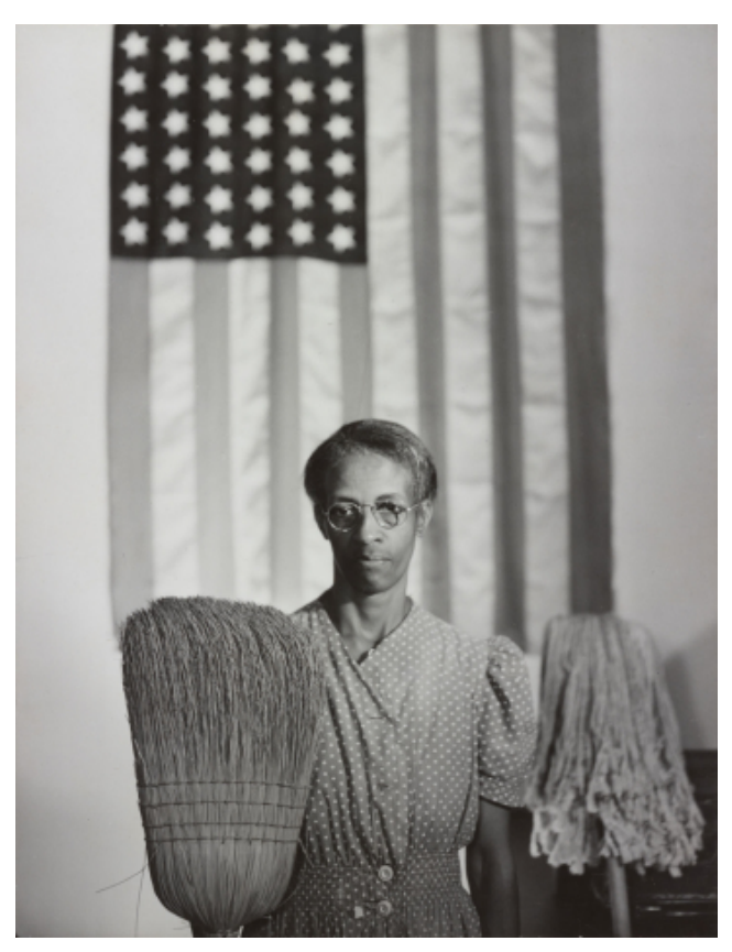
Gordon Parks, Washington, D.C. Government chairwoman, July 1942. Gelatin silver print mounted to board with typewritten caption sheet