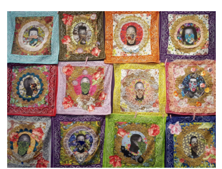
Of 72 by Ebony Patterson, detail view