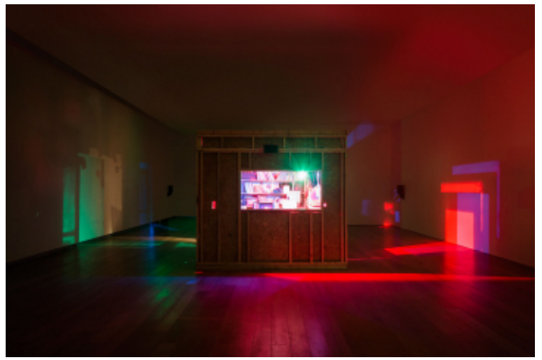
Opera for a Small Room