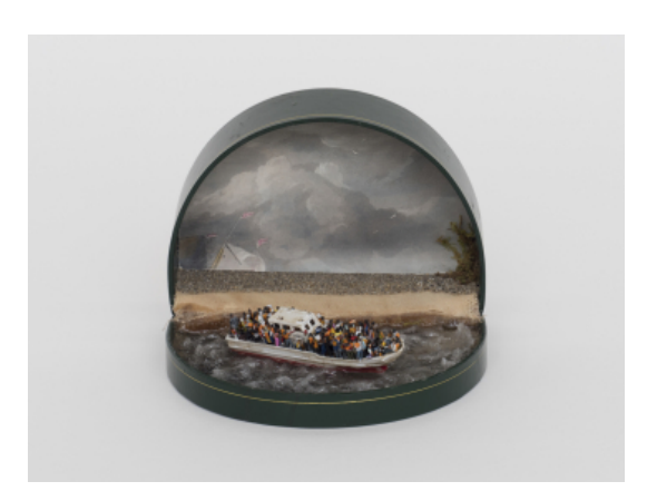
Curtis Talwst Santiago, "Deluge VII" (2016), mixed media diorama in a reclaimed jewelry box, (image courtesy the artist and Rachel Uffner Gallery)