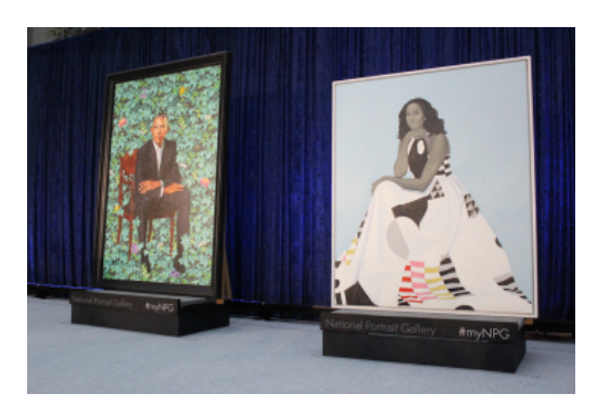
The official portraits by Kehinde Wiley (left) and Amy Sherald (right)

The unveiling and subsequent exhibition of President Barack Obama and First Lady Michelle Obama's official portraits at the National Portrait Gallery might best be described as an ongoing cultural phenomenon, rather than an exhibition. Nine months later, there are still crowds arriving to see them, and the Portrait Gallery gift shop is so full of Obama-related merch that it's easy to imagine, if only for a moment, that the portraits' subjects still occupy the White House. With rare exception, outgoing presidents have selected traditional portraitists for the works that are commissioned by the National Portrait Gallery. President Obama's selection of Kehinde