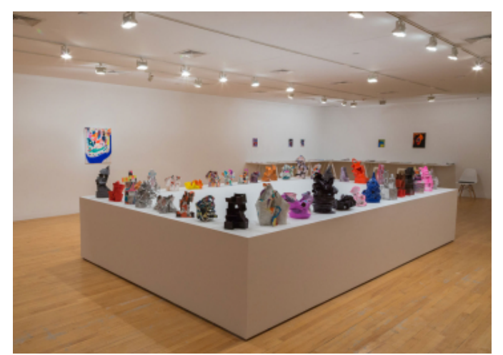
Partial view of Joanne Greenbaum: Things We Said Today installation