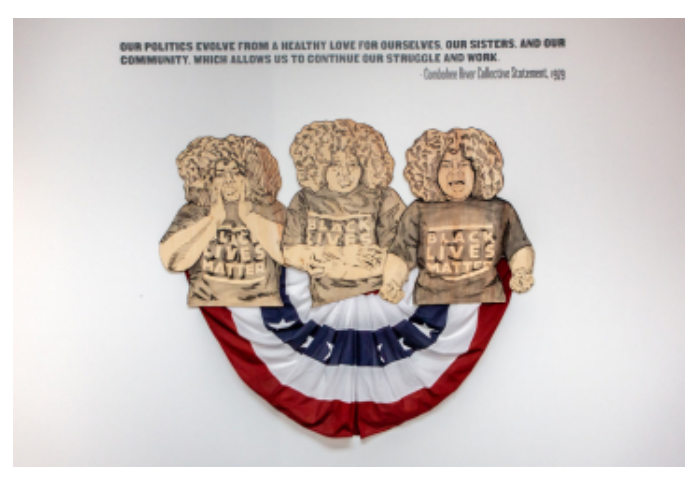
Chanel Thervil, "Pity Party: Selfies at the Start of the Trump Era," (2017), acrylic on wood with pleated flag