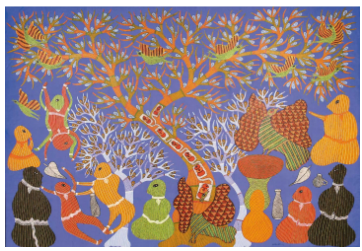
Ram Sign Urveti, "Woodpecker and the Ironsmith" (2011), acrylic on canvas